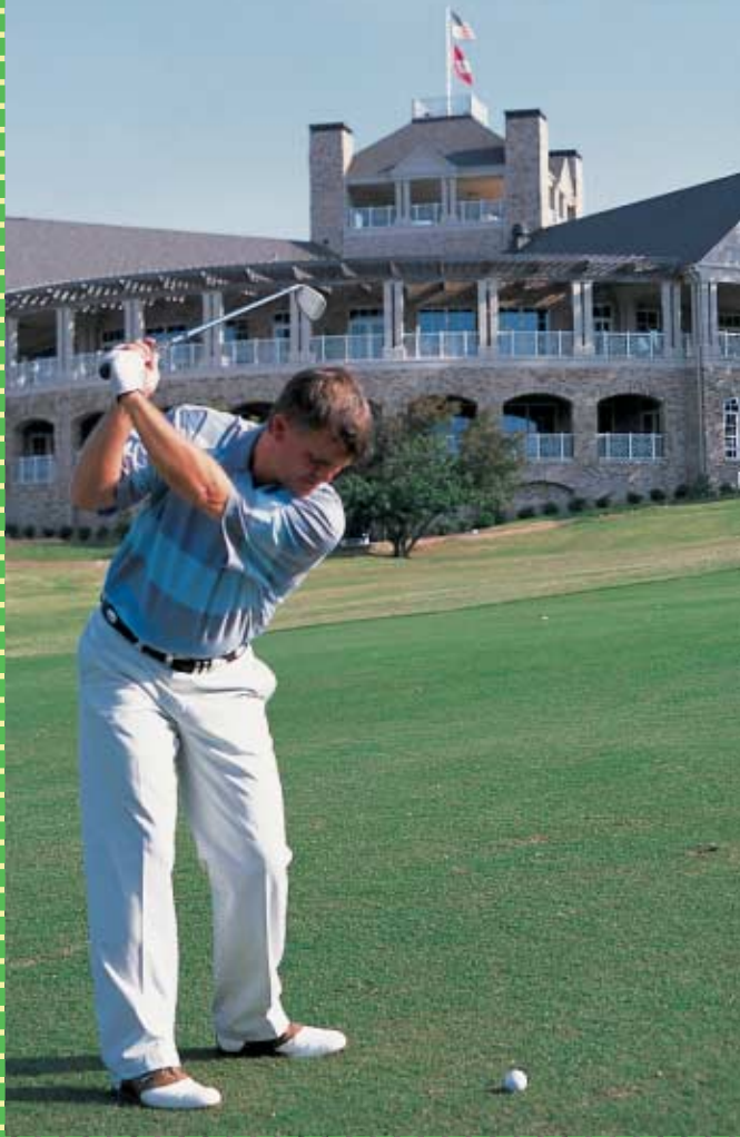
Hot Springs National Park, Arkansas

Membership Privileges for Our Guests The Arlington and Majestic Hotel Resorts and Spas